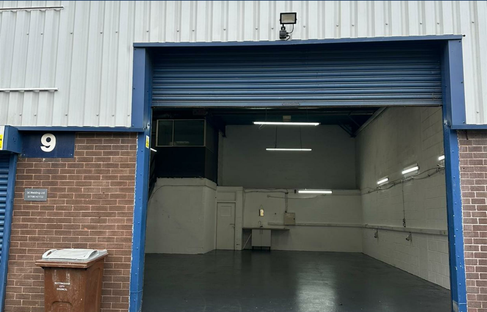
Unit 9 Leigh Street Industrial Estate, Leigh Street, Sheffield S9 2PR